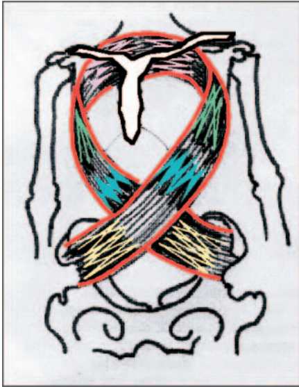
Figure 1. The serape musculature: rhomboids, serratus anterior, external obliques, and internal obliques.

viously improve the power and efficiency of this movement. Adding exercises of this nature to a swimmer's strength training program will ultimately increase the power and speed of the stroke.