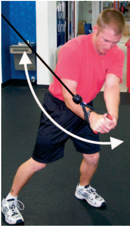
Figure 3. Diagonal chops are great for developing rotational power in the core. Increasing rotational power will increase the power of the stroke.

swim performance; therefore, it should be one of the focal points of any coach's dry-land or strength training program. This type of strength training philosophy may seem like common sense; however, many coaches still have their swimmers training muscles in one plane of motion in isolation and not addressing the needs of the core musculature. Remember, swimmers should train like swimmers, not bodybuilders! ♦